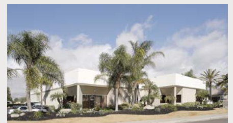
LAGUNA HILLS, CA