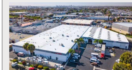
NATIONAL CITY, CA