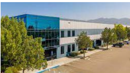
SAN DIEGO, CA